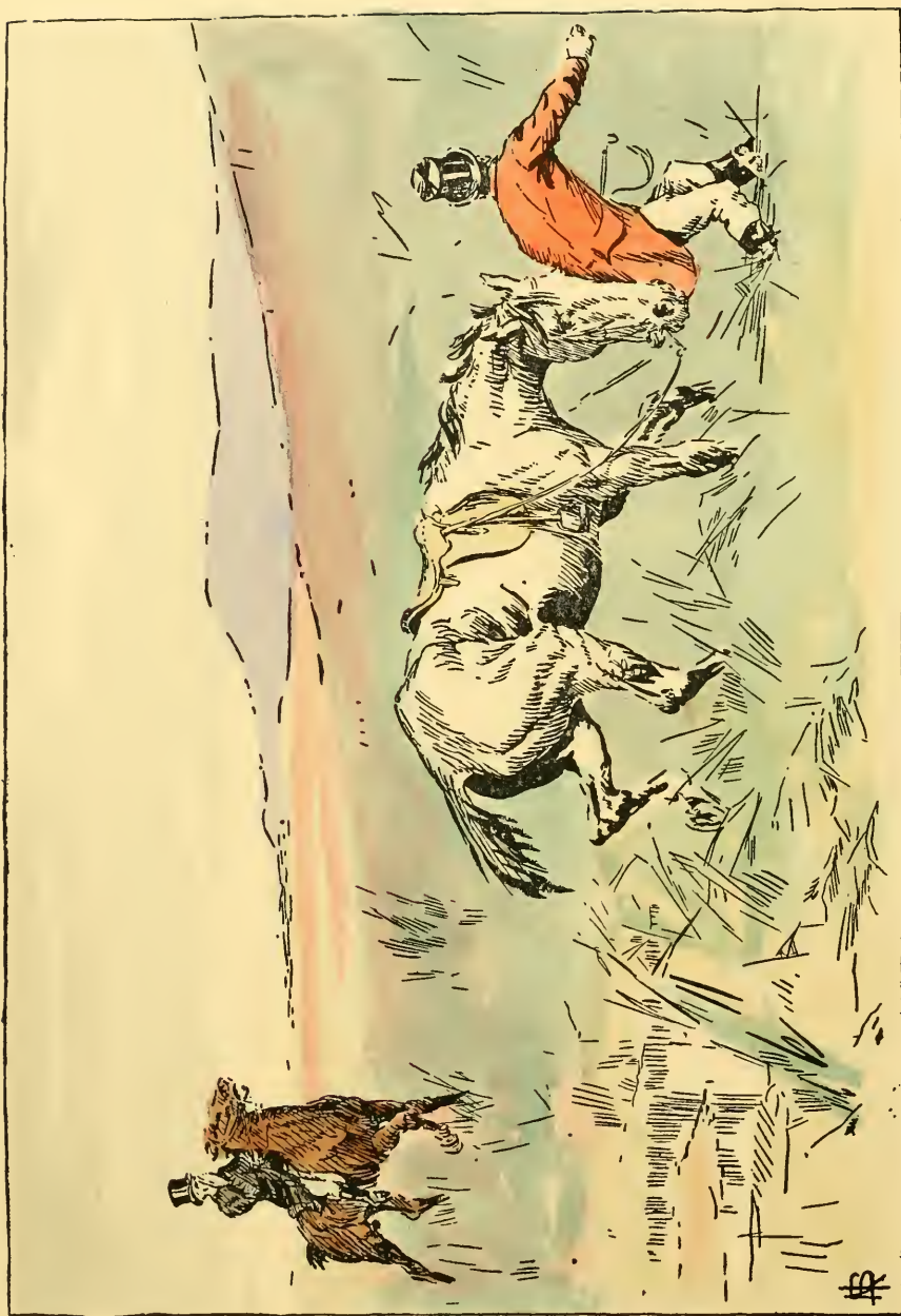
DIFFICULTIES OF AN EXMOOR BOG.