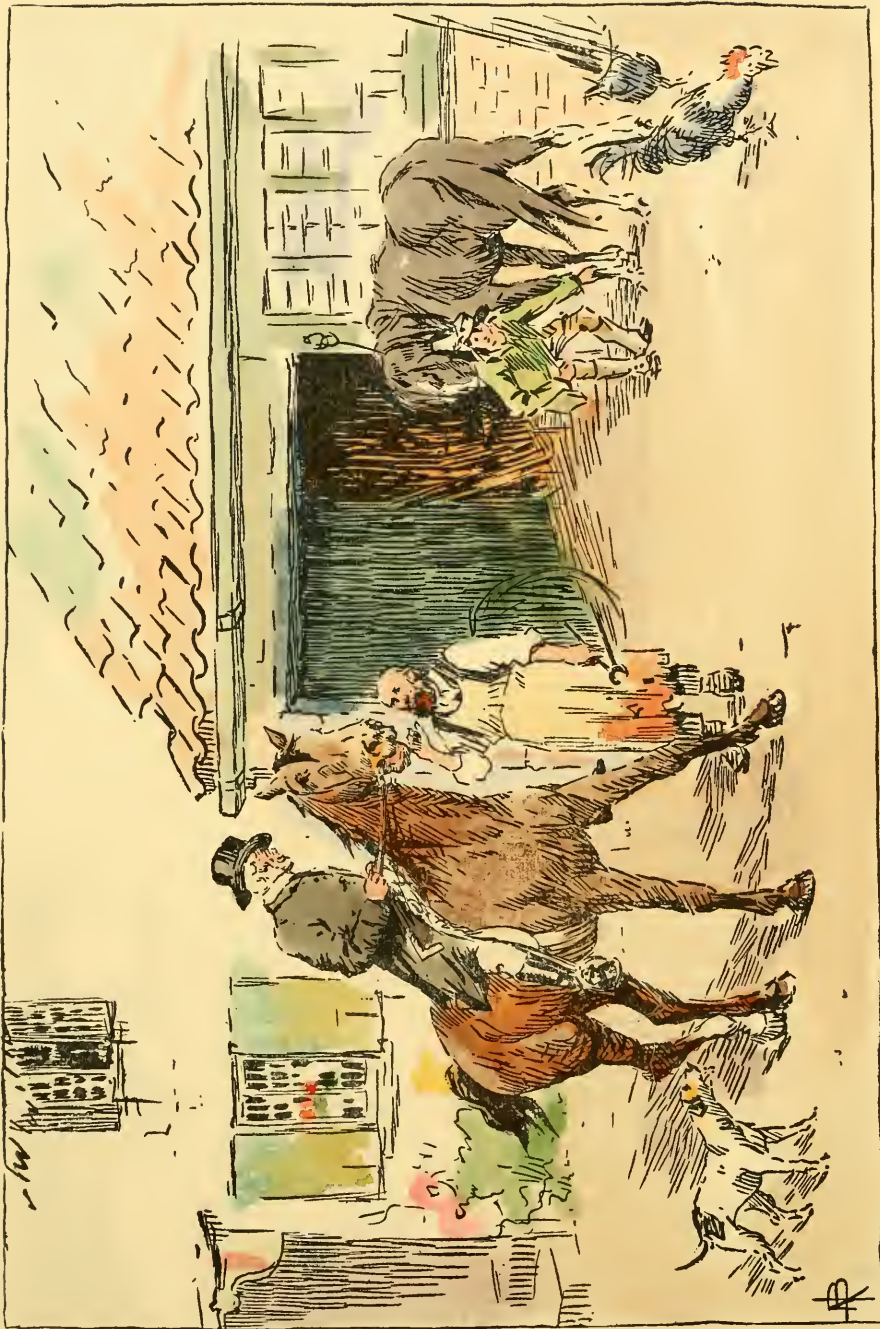
RUSSELL BECOMES SURETY FOR THE GIPSY.