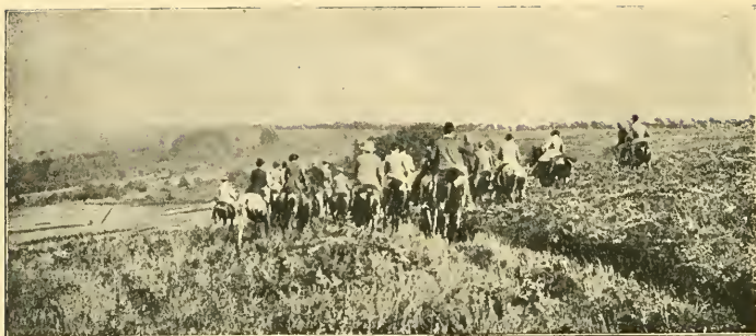
On Haddon Hill.