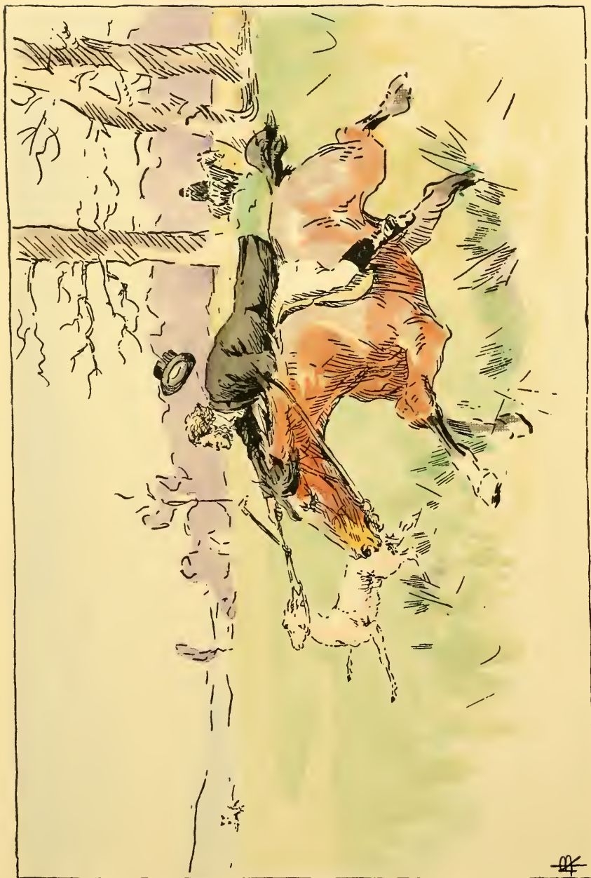
RUSSELL CATCHES A FAWN.