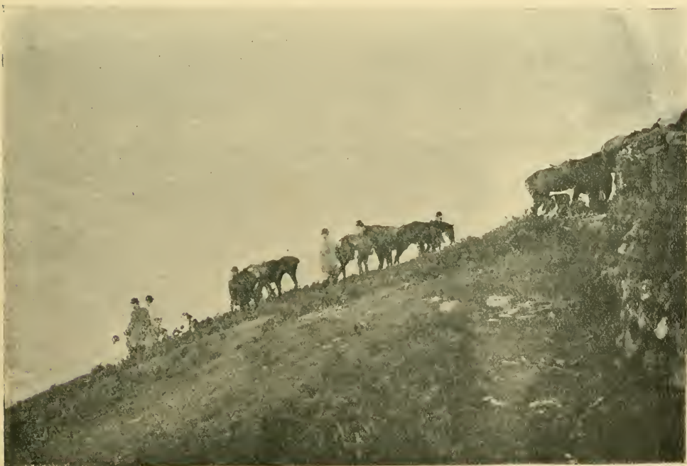
THE END OF A GOOD RUN.—MINEHEAD CLIFFS.