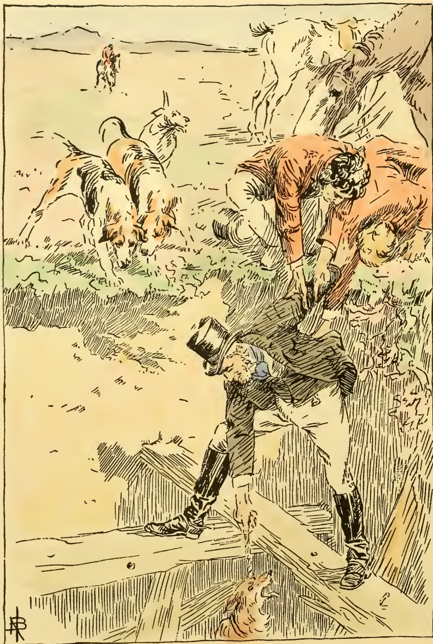
THE FINISH OF THE PENCARROW RUN.