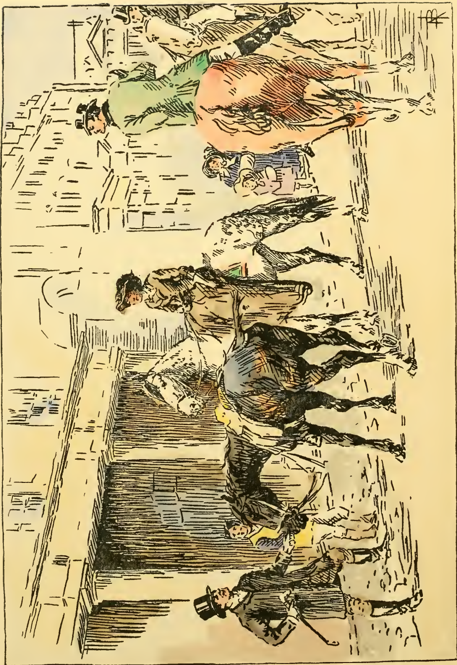
RUSSELL AT BATH IN 1826.