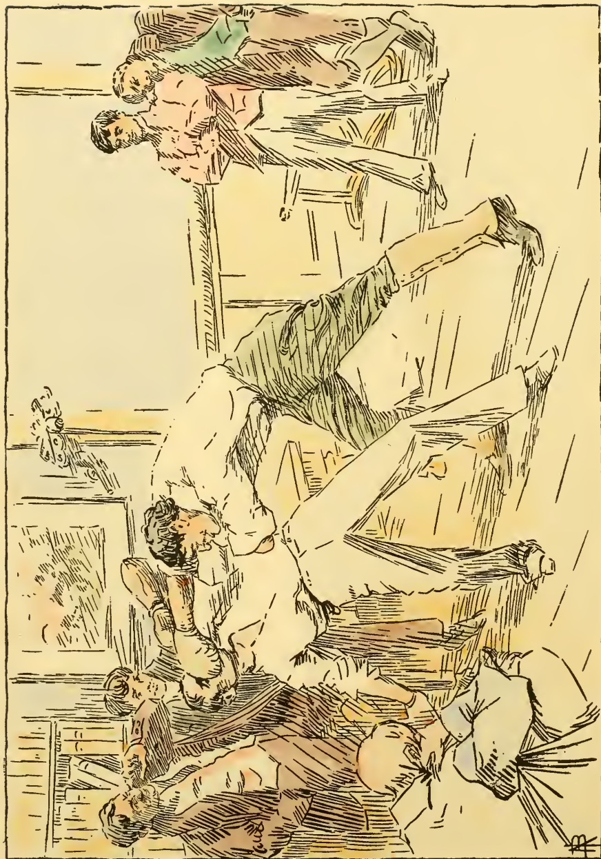
A 'SET-TO' WITH DENNE.