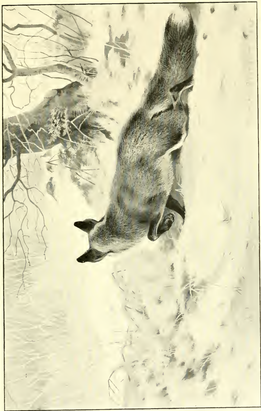
'HUNTING IS HIS LIFE'