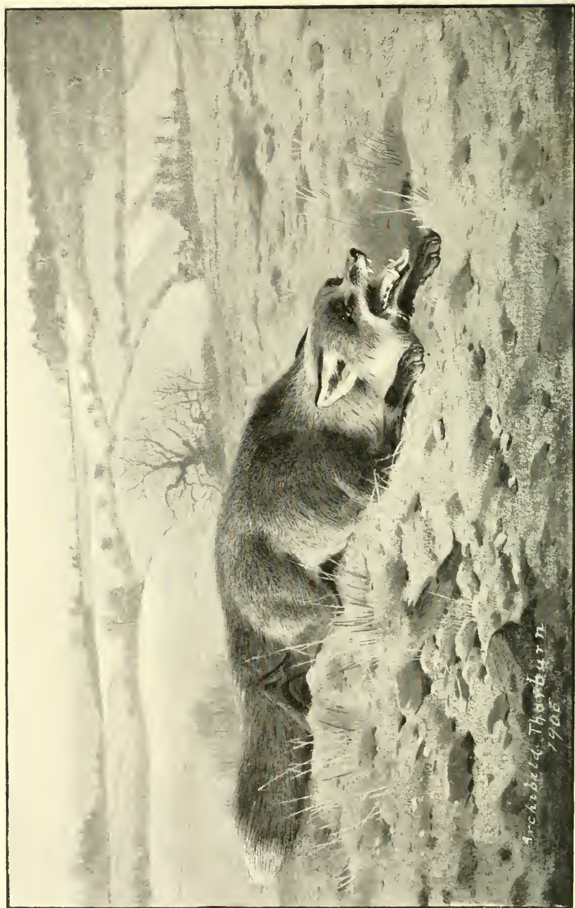
'HIS STRENGTH EXHAUSTED AND WILES EXPENDED'