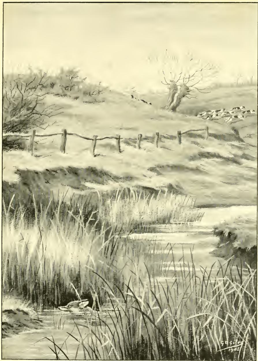
'THE FOX WAS SEEN TO SWIM BACK'