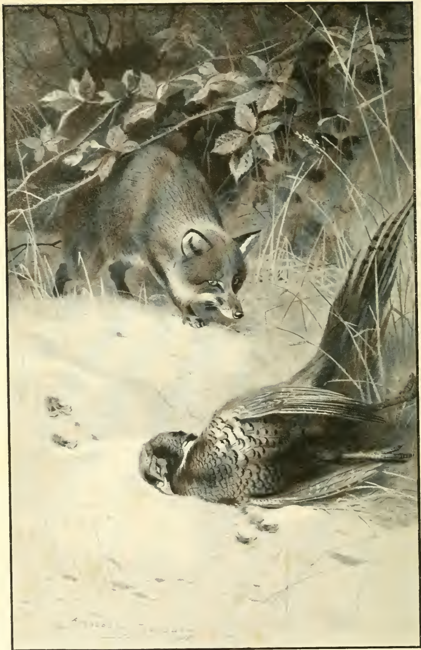
GLEANNING AFTER THE SHOOTERS